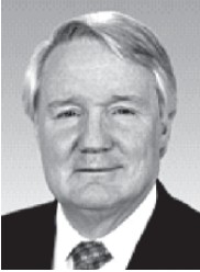
CONGRESSMAN JOHN BRYANT CHAIRMAN OF THE BOARD

"Education is the most powerful weapon which we can use to change the world."